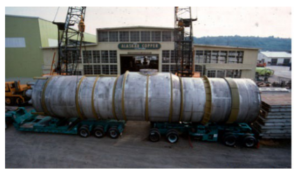
Heating element of a vapor recompression evaporator being carefully prepared for special shipment.